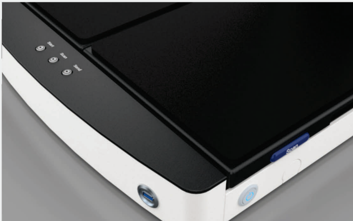
Store images directly to any USB devices via the USB 3.0 port